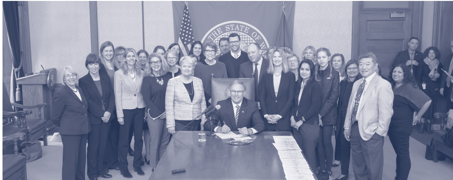
Governor Inslee signs Substitute Senate Bill No. 5996, March 21, 2018, relating to encouraging disclosure and discussion of sexual harassment and sexual assault in the workplace. Primary Sponsor: Karen Keiser

I am so pleased to report that the women of Washington were **The Stars** of the 2018 session.