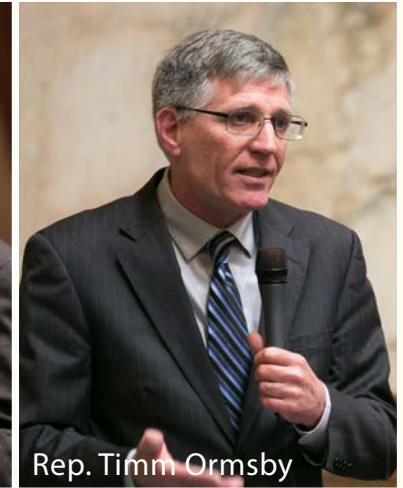
Rep. Timm Ormsby