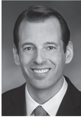
Senator Andy Billig

DISTRICT OFFICE: 25 West Main, Suite 237 Spokane, WA 99201 (509) 209-2427